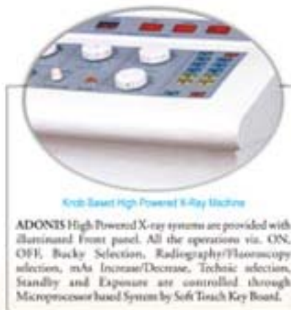
Krib Based High Powered X-Ray Machine

ADONIS High Powered X-ray systems are provided with illuminated front panel. All the operations via ON, OFF, Bucky Selection, Radiography/Fluoroscopy selection, mAs Increase/Decrease, Technic selection, Standby and Exposure are controlled through Microprocessor based System by Soft Touch Key Board.