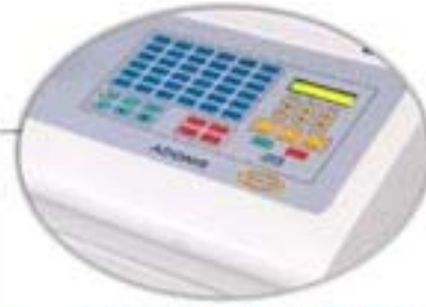
Auto Programmable High Powered X-Ray Machine